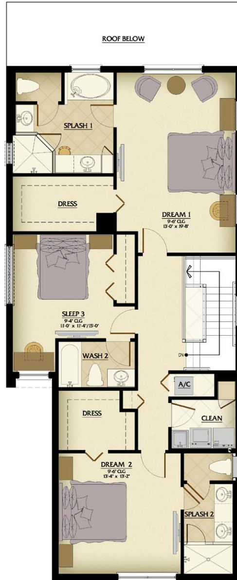
Second Floor Plan with Double Dream Rooms

Guava model kitchen and master bath available in modern or traditional designs with granite countertops and framed mirrors. All designs and colors shown are standard.