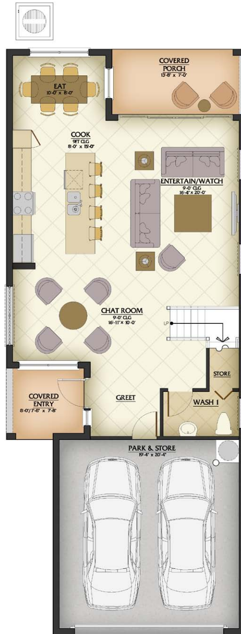
First Floor Plan with Chat Room